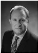
Robert G. Sarver, 56

Mr. Sarver has been a director since December 1996. Effective April 1, 2018, Mr. Sarver will become the executive chairman of Western Alliance Bancorporation, transitioning from his previous position as chairman and Chief Executive Officer. Mr. Sarver is also the managing partner of the Phoenix Suns NBA basketball team. From 1995 to 1998, he served as chairman of Grossmont Bank. He was the chairman and Chief Executive Officer of California Bank & Trust from 1998 to 2001. Mr. Sarver earned a bachelor's degree in business administration from the University of Arizona and has been a certified public accountant.