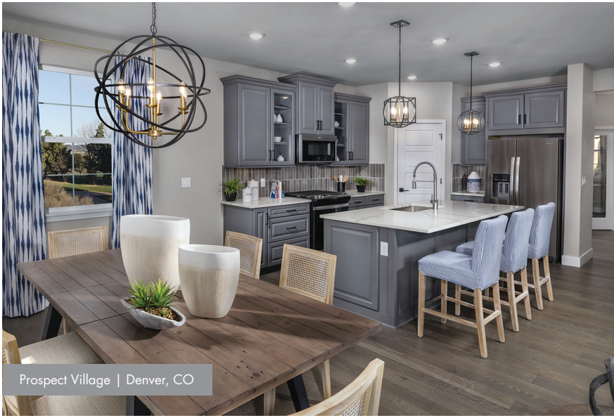
Prospect Village | Denver, CO