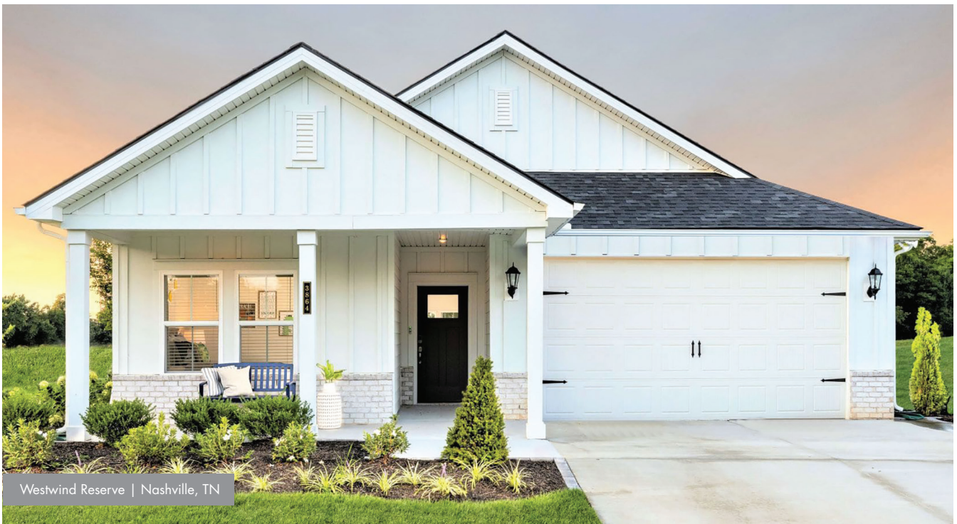
Westwind Reserve | Nashville, TN