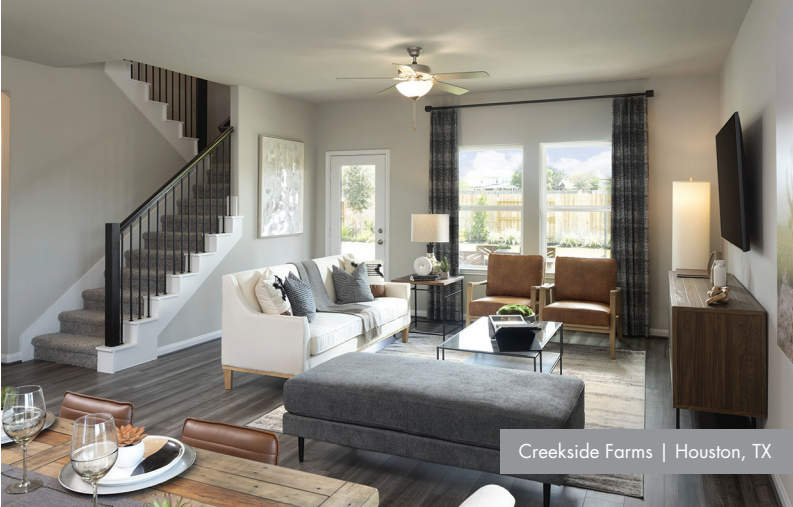
Creekside Farms | Houston, TX