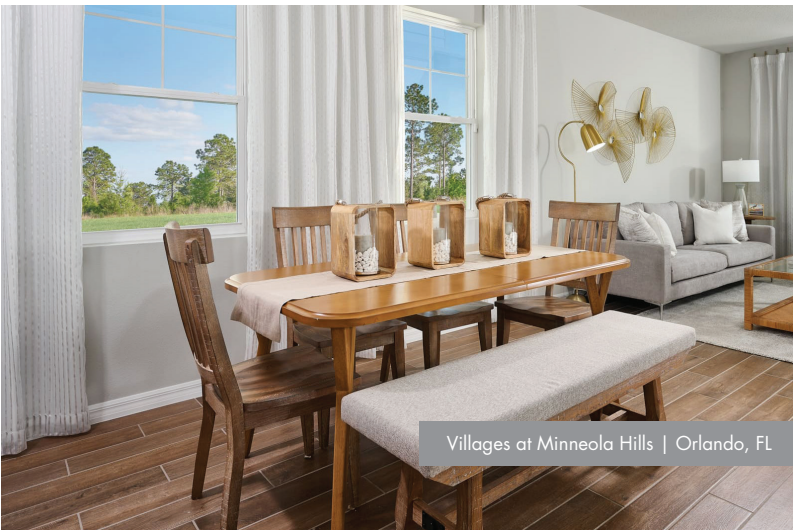
Villages at Minneola Hills | Orlando, FL