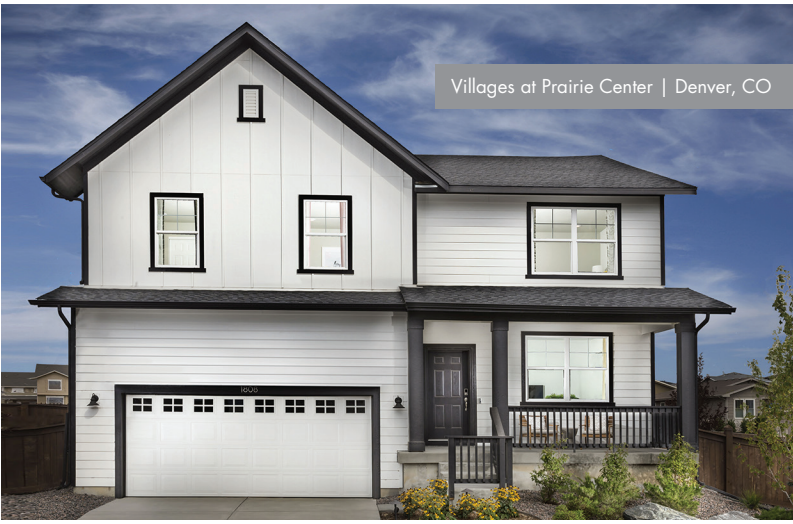
Villages at Prairie Center | Denver, CO