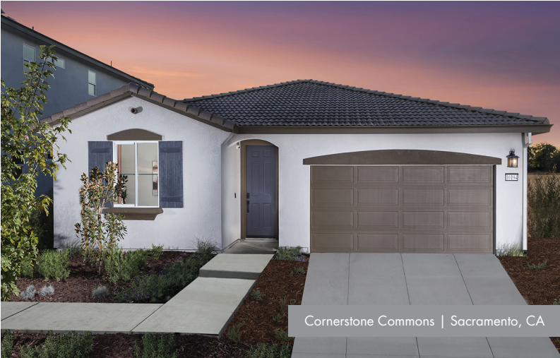
Cornerstone Commons | Sacramento, CA