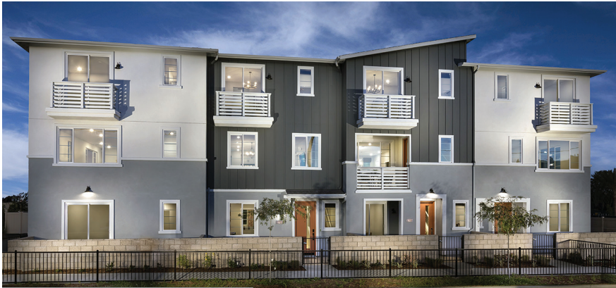
Cabrilla at Ponte Vista | Southern CA