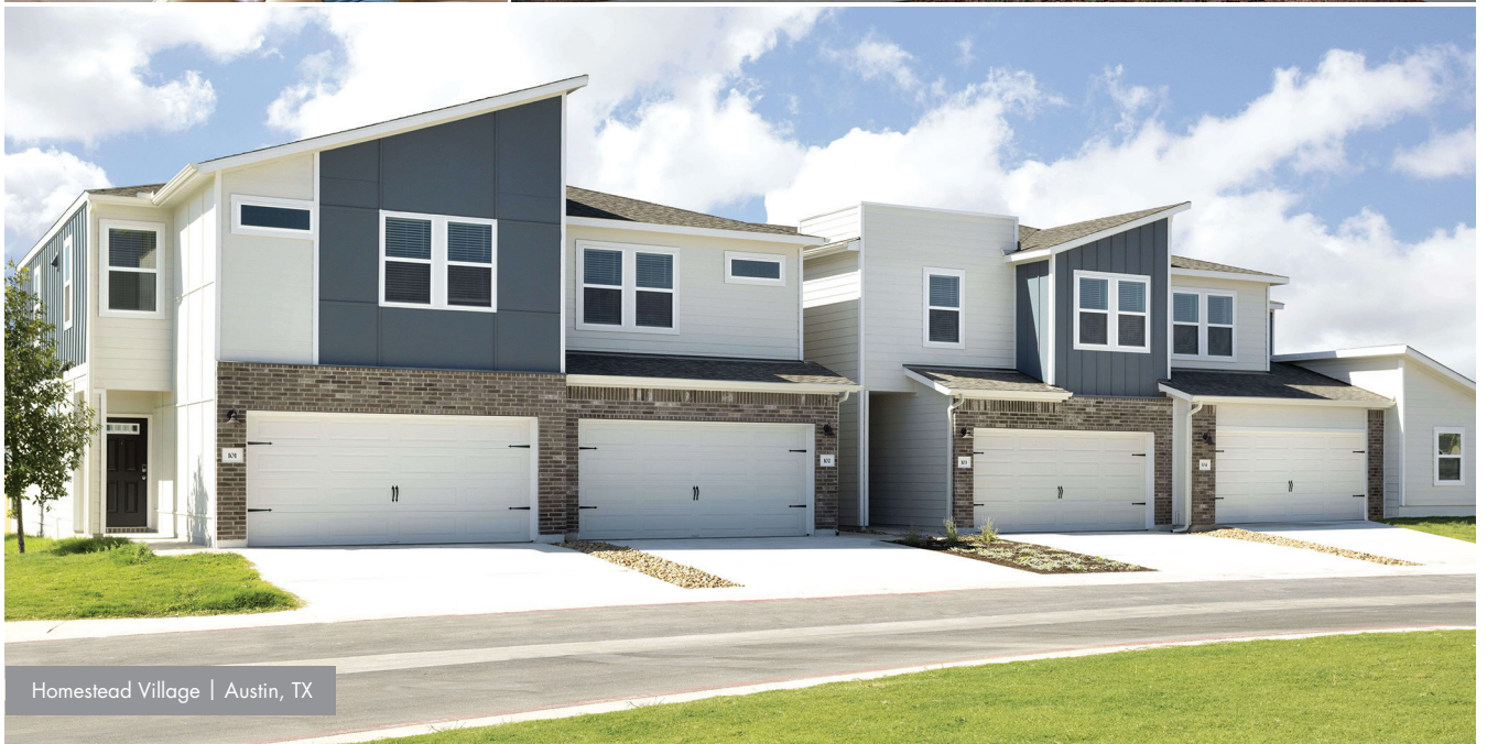
Homestead Village | Austin, TX