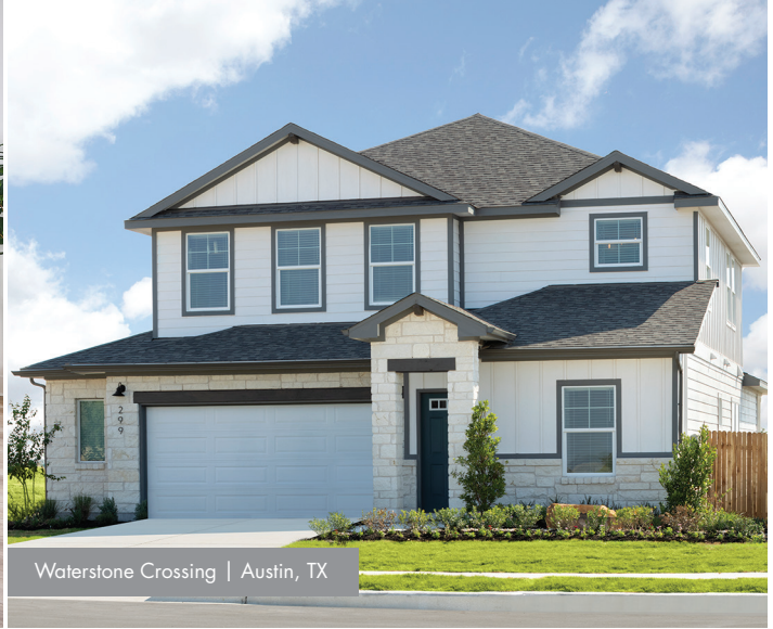
Waterstone Crossing | Austin, TX