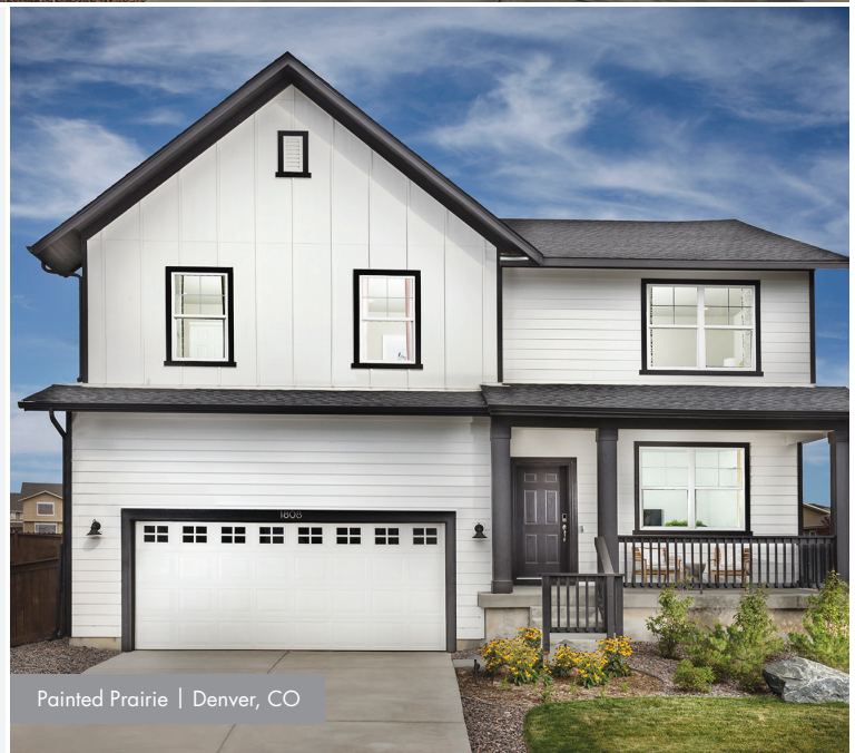
Painted Prairie | Denver, CO