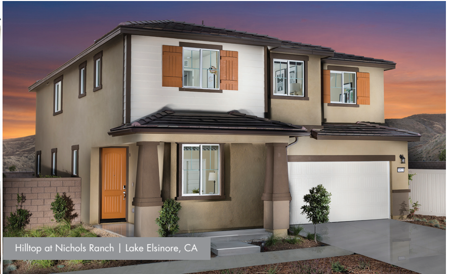
Hilltop at Nichols Ranch | Lake Elsinore, CA