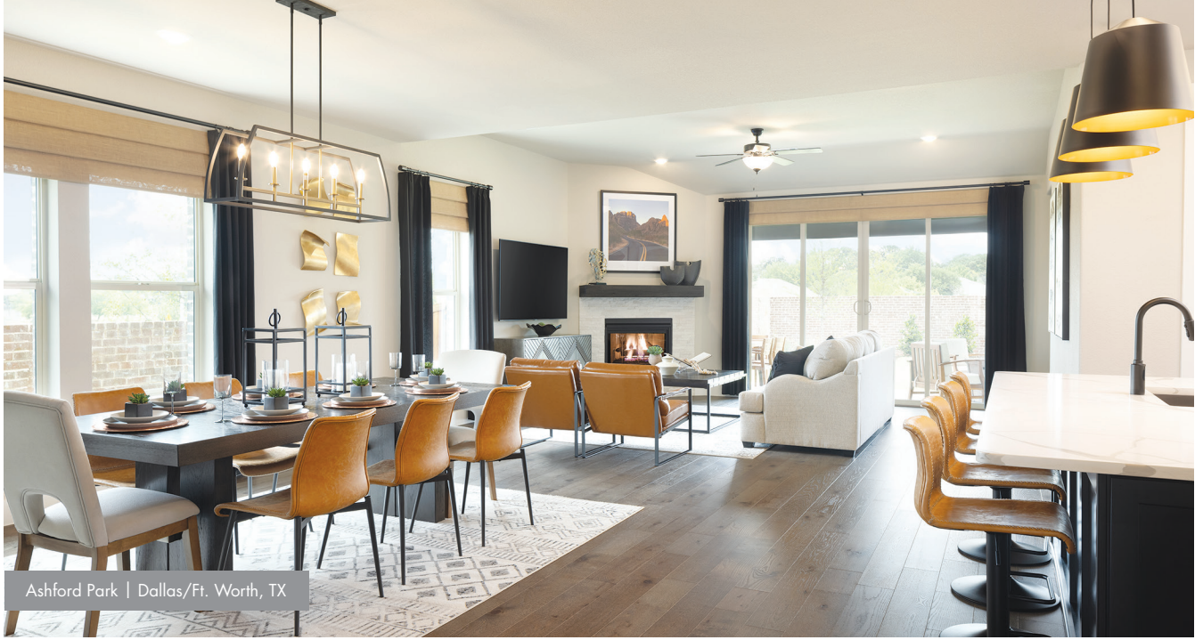
Ashford Park | Dallas/Ft. Worth, TX