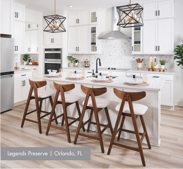
Legends Preserve | Orlando, FL