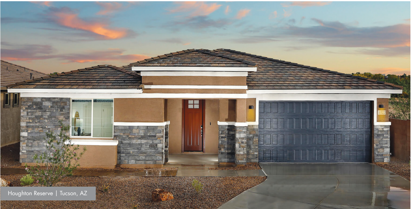
Houghton Reserve | Tucson, AZ